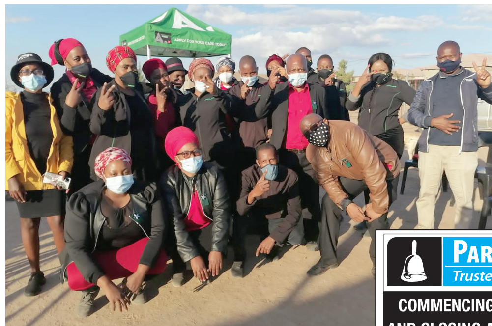
Members of the Mmotong Charity Group.